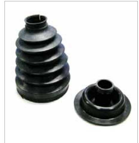
Figure 3: Height comparison of initial and final design

"Nonlinear analysis with Marc helps us dramatically improve the design of CV boots and other products," Kennison concluded. "The smaller we can make the boot, the longer it will last. Our simulation capabilities enable us to design boots that substantially outlast competitive designs. The result is that we have been able to increase our market share in our traditional markets and successfully enter new markets."