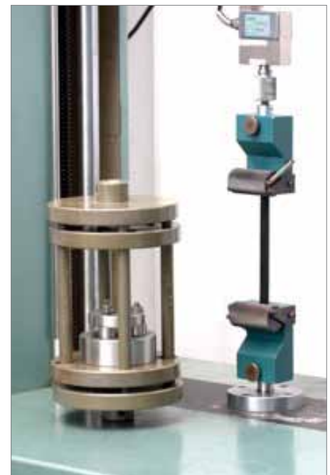
Figure 4: Race-Tec tensile test machine